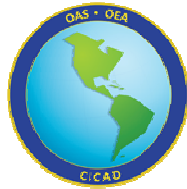
Inter-American Drug Abuse Control Commission

The Demand Reduction Unit of the Inter-American Drug Abuse and Control Commission (CICAD) of the Organization of American States (OAS) recognizes the critical role that organizations involved in reducing demand for drugs play in the effort to lessen the impact of drugs on our individual countries, the wider region and hemisphere. The CICAD Training and Certification Model for Drug and Violence Prevention,