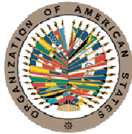
Organization of American States