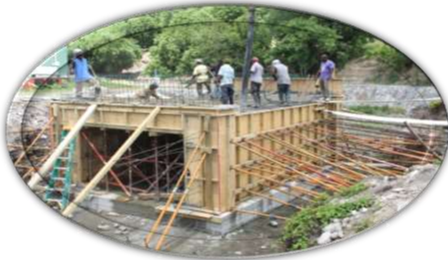
Construction of the Bath Bridge in St. Johns' Parish