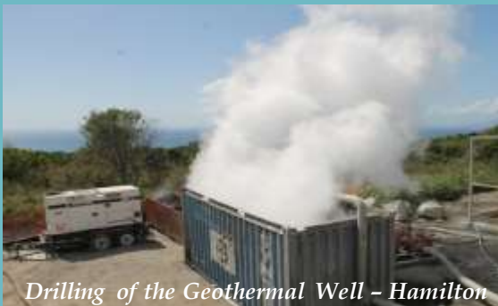
Drilling of the Geothermal Well - Hamilton