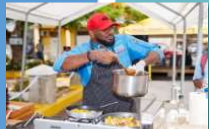
Nevis Mango Festival