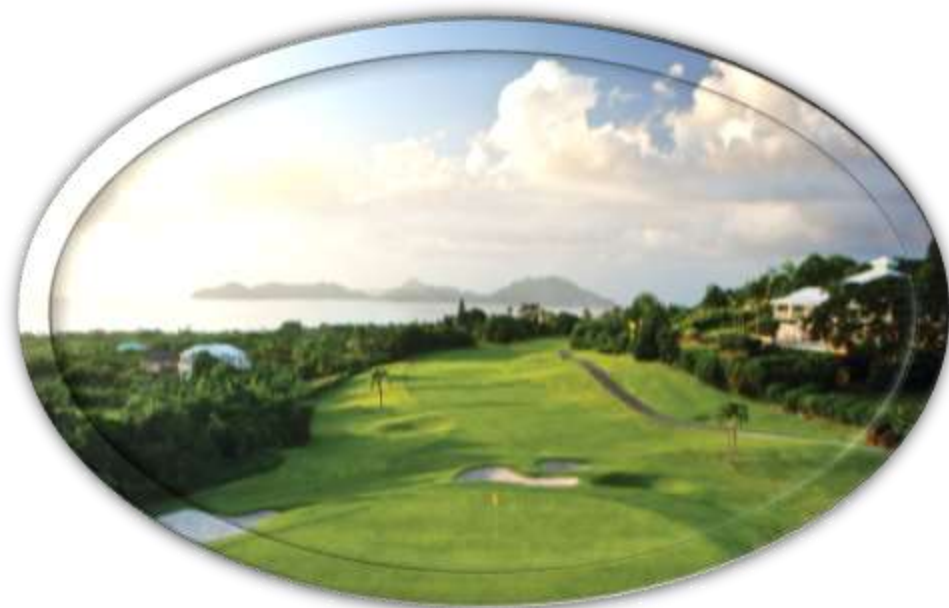
The Four Seasons Golf Course