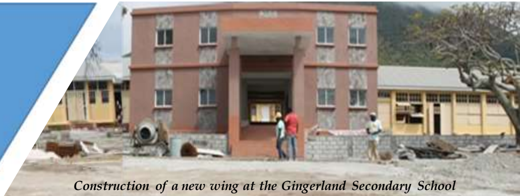
Construction of a new wing at the Gingerland Secondary School