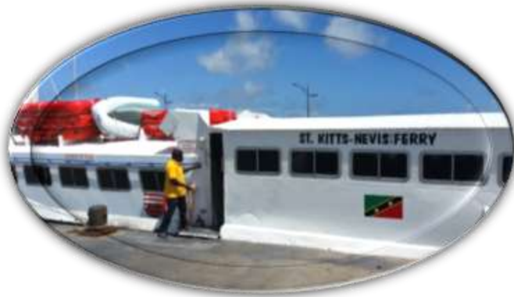
M V Caribe Queen docks at Charlestown Pier