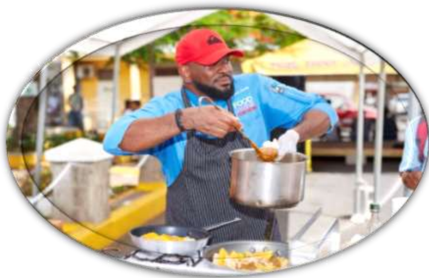
Nevis Mango Festival